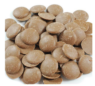
Milk Chocolate Pistoles (NOE102) 11 lb.